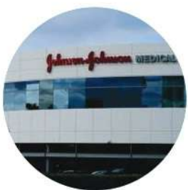
Johnson & Johnson