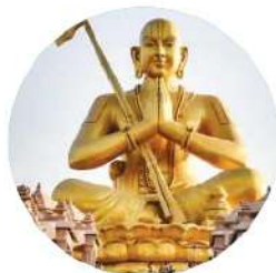
Statue of Equality