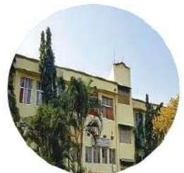
TATA Institute of Social Science