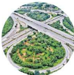
Outer Ring Road (ORR)